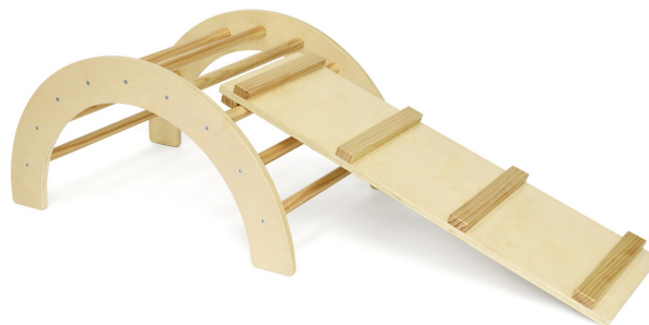
N658011 Play Gym