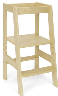
N613011 Learning Tower