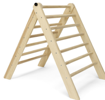
N654011 Climbing Triangle